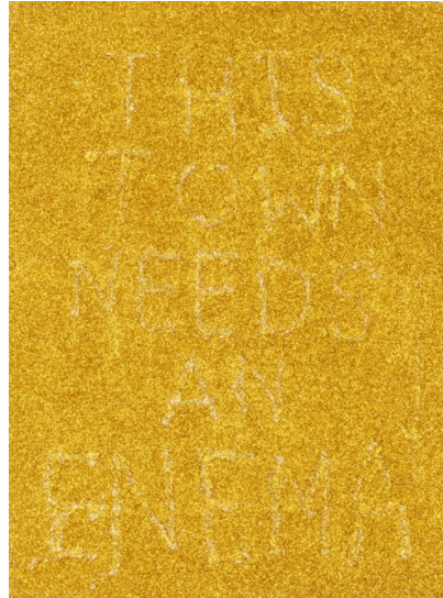
Jayson Keeling "This Town Needs An Enema," 2010.