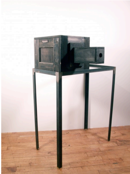
Tommy Hartung "Camera" 2009.