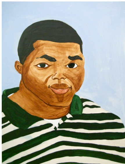
Rudy Shepherd, "Jesse Rae Beard, Jena 6," 2007.