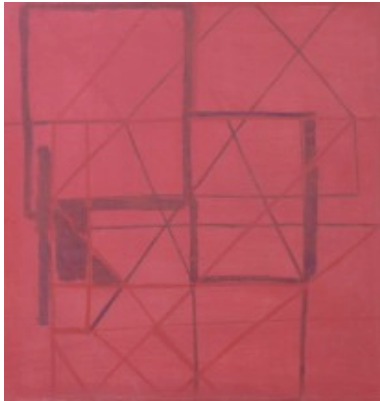
Paul Pagk "OGLS #116" 2010.

By Mackie Healy, Art Market Views Contributor