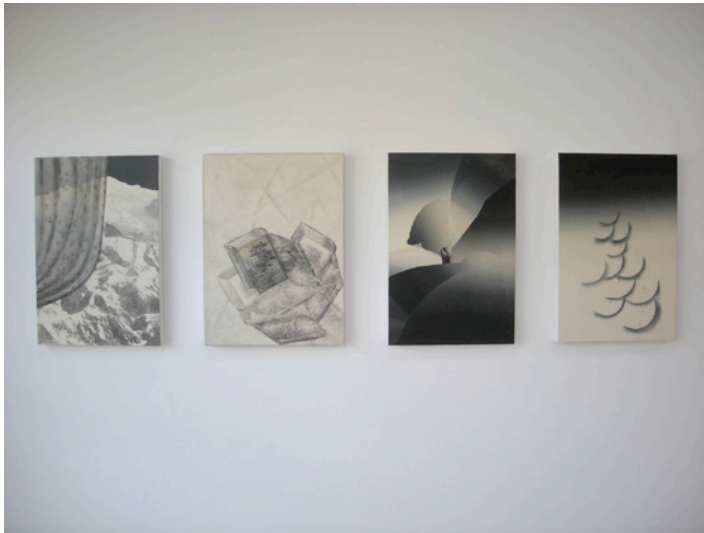
A series of new smaller paintings.