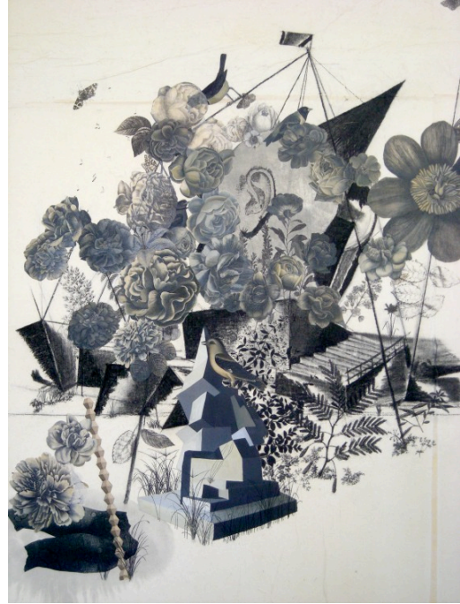
Detail of “Nocturne with Head and Flowers” showing all the dense layering involved in the work. Is that a Brancusi in the bottom left hand side?