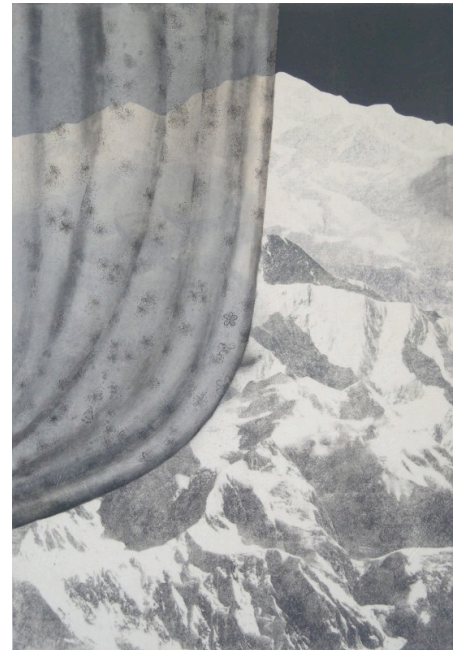
The mountains in this image are a print while the curtain is oil paint.