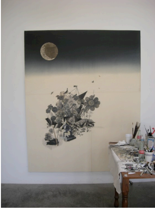
“Nocturne with Head and Flowers” In progress...